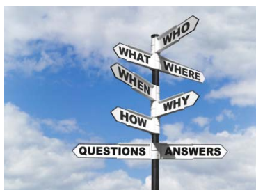
Keeping tabs on your business